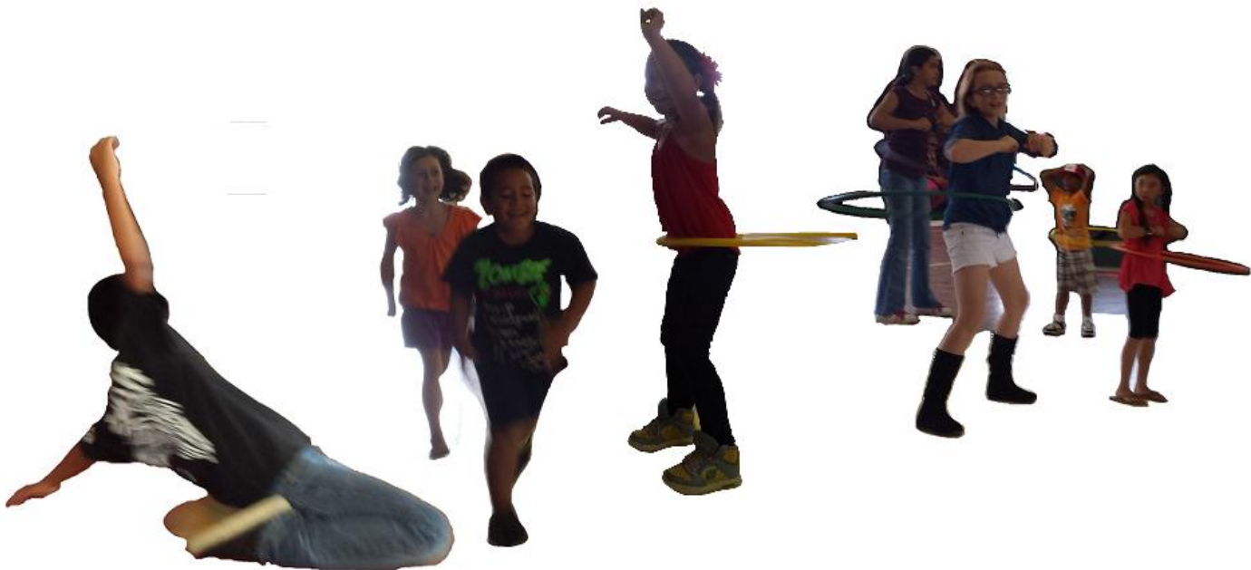
Every grade level participated and had a great time!