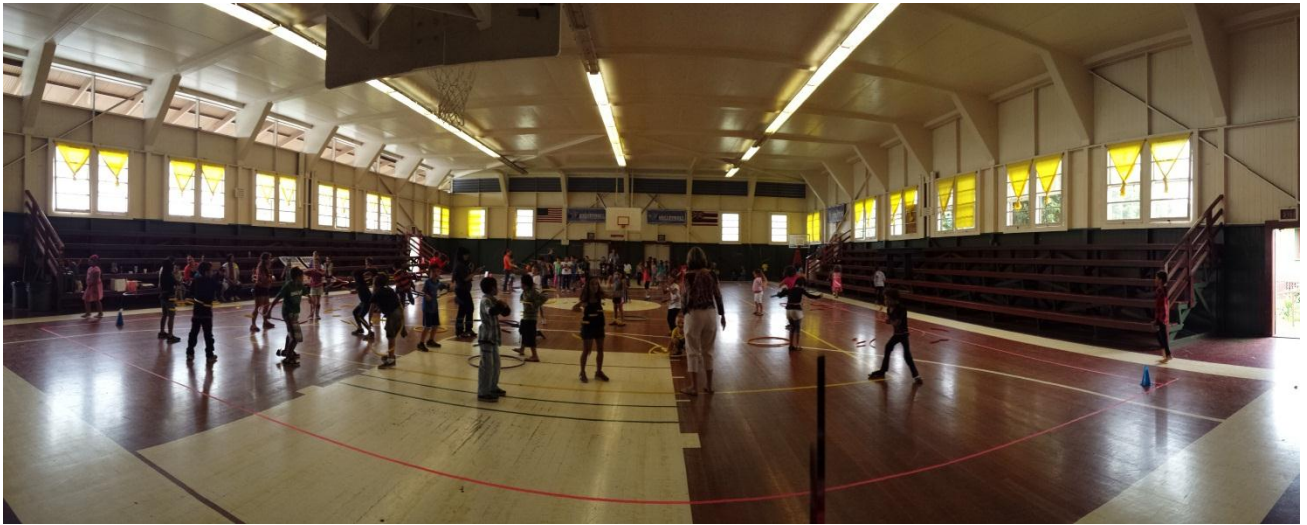
Our gym was filled with kids running, jumping, hooping, and dancing!

Together we raised $4,116.60 for the American Heart Association!!