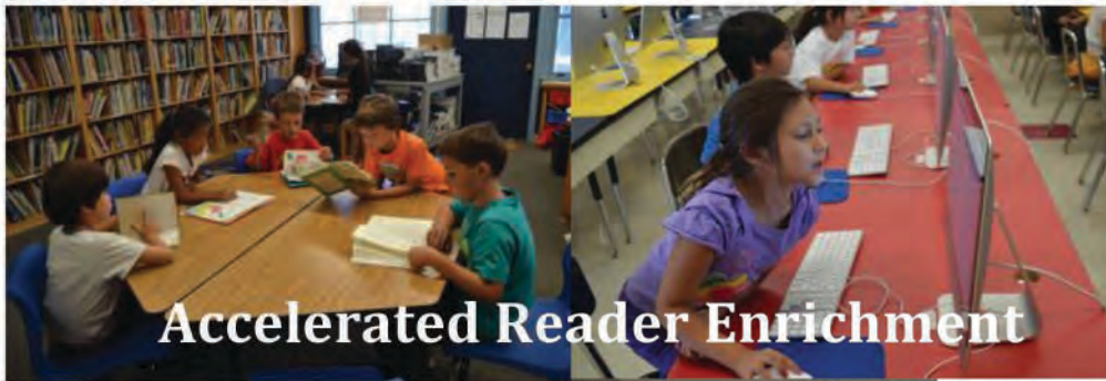
Accelerated Reader Enrichment

Here are just a few examples of your FOS dollars at work for our kids!