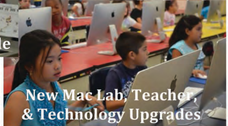
New Mac Lab, Teacher, & Technology Upgrades