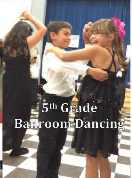
5 th Grade Ballroom Dancing