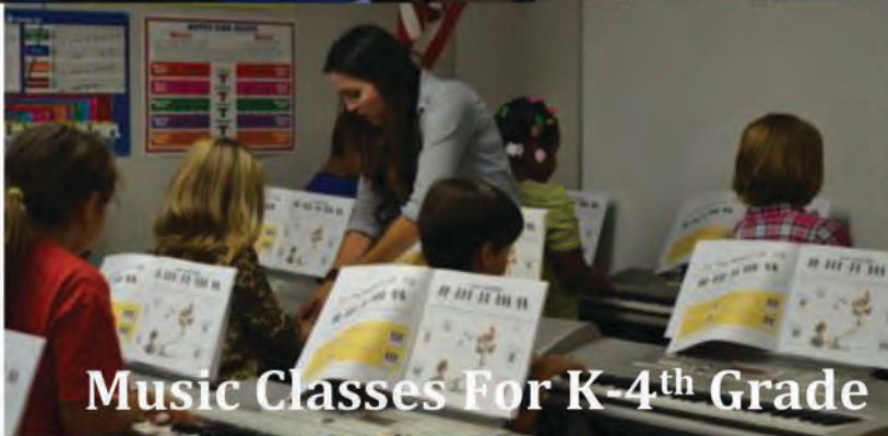
Music Classes For K-4 th Grade