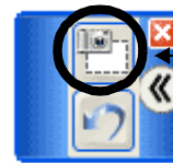
Floating Tools Toolbar

NOTE: If the Floating Tools toolbar does not appear when you pick up a pen, you may be working in an Ink Aware application (e.g., Microsoft Word). If the application is Ink Aware, these buttons will be available in the application's own toolbar.