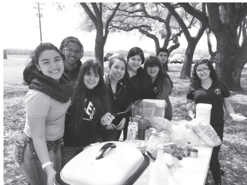
The Freshmen class sold snacks during the Field Day event on March 13.

Presbyterian Pan American School (PPAS) have just taken Terra Nova test March 12 and 13. In tradition, the students and staff had a Field Day after a morning of testing. Students had the opportunity to relax on the shade of a tree and read a book, or play sports with their friends, while the Junior class worked on Prom Decorations. "I like the idea of a relax time like field day after a hard test like the Terra Nova," said Junior National