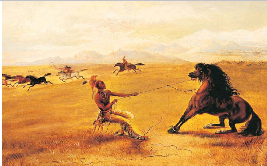
This painting shows Native Americans catching wild horses. Many would later use the horses to hunt buffalo on the Great Plains.

Contact also led to conflict. As English settlers pushed into the Backcountry, they put pressure on Native American tribes. Some tribes reacted by raiding isolated homesteads and small settlements. White settlers struck back, leading to more bloodshed.