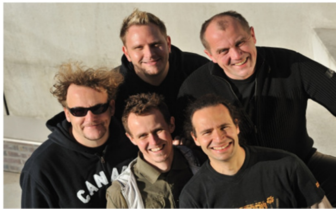
"Wise Guys" - a cappella group