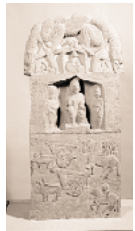
Buddhist stela Northern Wei dynasty (386–535), dated by inscription Jianming, second year, or 531. Found Xinji Township, Pengyang, Ningxia. Sandstone. Height: 48 cm; width: 20.8 cm. Guyuan Municipal Museum, Ningxia Hui Autonomous Region.

The arrival of Buddhism in China was officially noted by the imperial court in the mid-1 st century CE, and the faith spread in China thereafter, helped by both official and private support for the building of temples and monasteries. Buddhist missionaries from Central Asia began an active program of translating sacred texts into Chinese, and a number of Chinese priests and monks, over the centuries, traveled the Silk Road in search of doctrinal instruction in India. Buddhism spread from China to Korea and Japan by the 6 th century CE; it retained a dominant position in China until the decline of the Tang dynasty in the 9 th century. Thereafter Buddhism remained important in China, but more as a private than an officially sponsored religion.