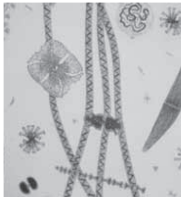
Some organisms, such as the California quail on the left, are made up of trillions of cells. The protists on the right are made up of one or a few cells. They are so small they can only be seen with a microscope.