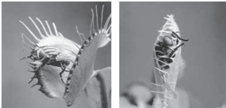
The touch of an insect is a stimulus for a Venus' flytrap. The stimulus causes the plant to close its leaves quickly.