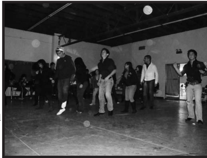
PPAS students are dancing at the school's welcome back dance on Jan. 15.

The dance ended at 10 p.m. because of the number of missing students.