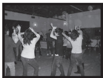
PAGE 7 WELCOME BACK DANCE