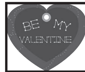
PAGE 8 VALENTINE'S DAY WISHES

JANUARY 31, 2010 • VOLUME 7 • ISSUE 1 • KINGSVILLE, TX 78363