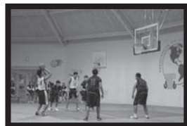
BASKETBALL Boys beat Academy JV

JANUARY 31, 2010 • VOLUME 7 • ISSUE 1 • KINGSVILLE, TX 78363