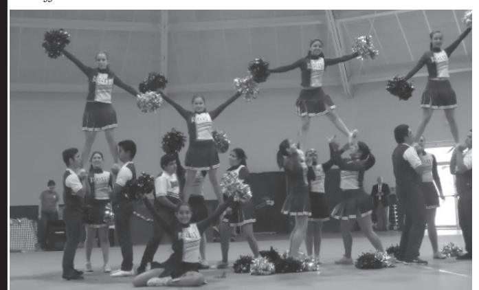
PPAS Cheerleaders ended the Homecoming Week with a pep rally and performance.