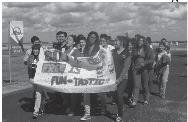
The Freshmen class won the poster contest for RRW.