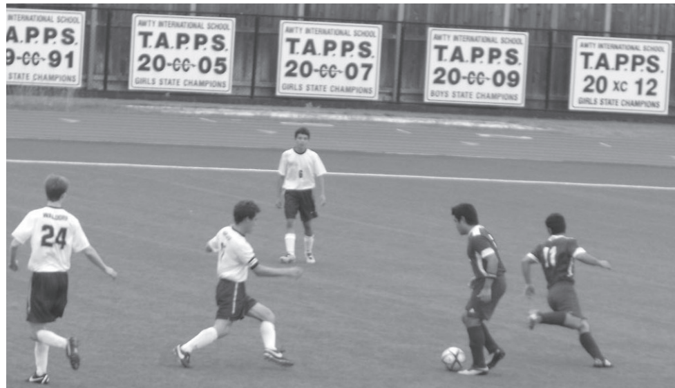
PPAS Eagles soccer lost, 0-1, against Forth Worth Bethesda in a regional final game.