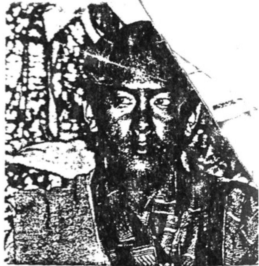
KING JIGME WANGCHUCK, ABSOLUTE MONARCH OF THE KINGDOM OF BHUTAN IN ASIA.

Totalitarian governments are those in which the state takes complete control. The rights of citizens in totalitar-