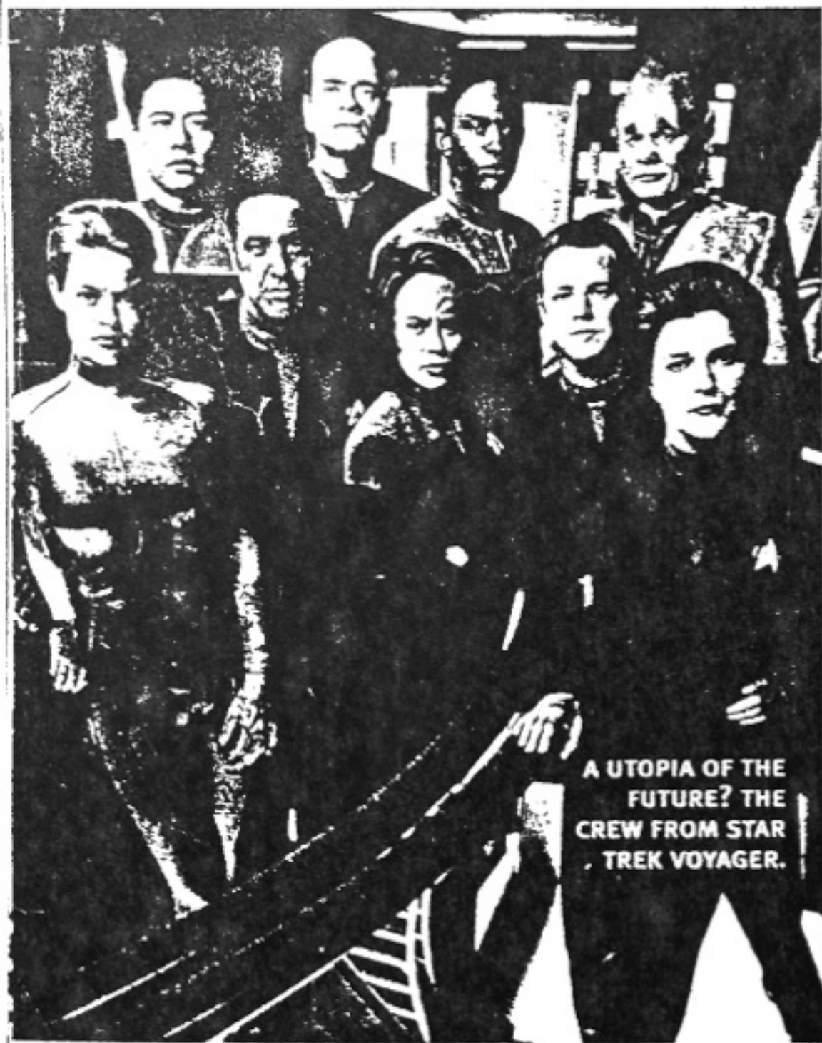
A UTOPIA OF THE FUTURE? THE CREW FROM STAR TREK VOYAGER.

Still, as any loyal Trekkie could tell you, as long as there are problems on earth today, and "strange new worlds" to ponder in the future, human beings will imagine a better government, a better world—and a better universe. ■