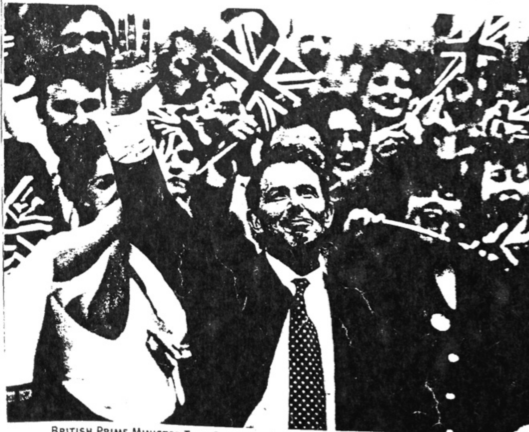
BRITISH PRIME MINISTER TONY BLAIR. HIS LABOR PARTY CONTROLS THE BRITISH PARLIAMENT.

As a concept, democracy dates from the ancient Greeks. As an actuality, it dates to American and French revolutions of the 18th century. The United States, which symbolizes democracy for most of the world, is a