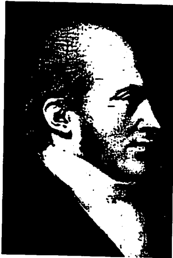
Aaron Burr The most self-assured and aristocratic of the founders, he was also the most like a modern politician, openly working for his own interests.

But the bad goods would return from Monticello in 1797, when Adams was elected president and Jefferson, as runner-up, the vice president. Instead of supporting the president, Jefferson fed the opposition press and even covertly counseled the French to draw out peace negotiations as long as possible, a delay that probably ended up costing Adams the next election. If that weren't mischief enough, after the Alien and Sedition