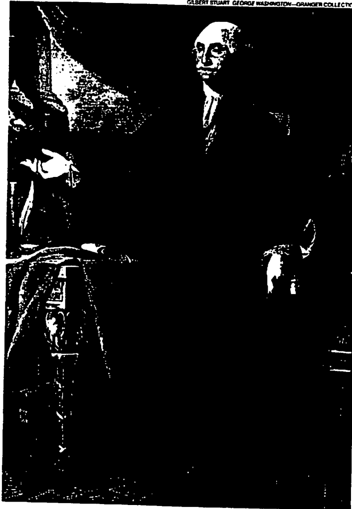
GILBERT STUART, GEORGE WASHINGTON

T he one argument that got cut short, with tragic consequences, was that over slavery. Congress effectively removed itself from a constructive role in the debate in 1790. In that year, two Quaker delegations petitioned Congress to bring an end to the slave trade, petitions that prompted outrage among many legislators, who pointed out that the Constitution expressly forbade discussion of slave trade until 1808. The petitions would have been ignored, in fact, had they not come with the endorsement of Benjamin Franklin. Franklin, who himself