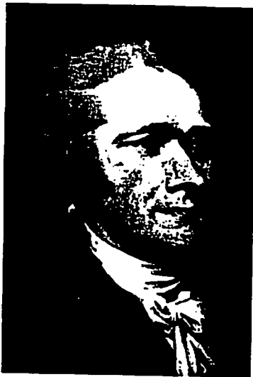
Alexander Hamilton A self-made man, energetic, forthright, and blunt to the point of arrogance, he was physically and intellectually bold, and extremely loyal.

The founders recognized the problem almost immediately after the Revolutionary War. Indeed, the drafting and ratification of the Constitution in 1787-88—the "second founding"—was partly an attempt to contain the excesses of narrow localism and interest-based politics. Hamilton and Madison, two vigorous champions of a new national charter to supplant the weaker Articles of Confederation, repeatedly made that point in their Federalist Papers . But the founders' dream that the national government might serve as a bulwark of disinterestedness against the powerful tide of interest-group factionalism was soon dashed by the realities of politics, including clashes among the founders' own interests. Having decried the factionalism that they saw rampant at the state level, they