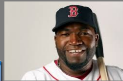
The MVP of 2013 World Series: Da-

Results of Game 2: Cardinals win 4-2 . The Cardinals won because of the heroic hitting and defense of Carlos Beltran.