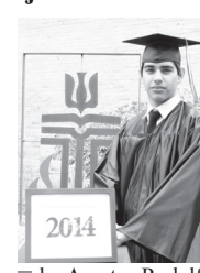
by Arantza Rudolfo