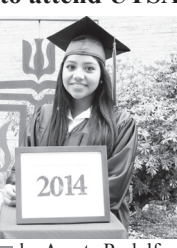
by Aranta Rudolfo