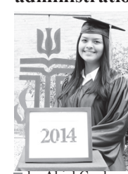
by Abiel Cardenas