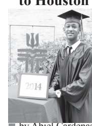
by Abiel Cardenas