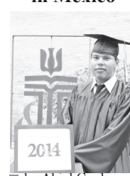
by Abiel Cardenas