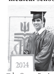
by German Penaloza