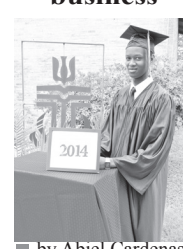
by Abiel Cardenas