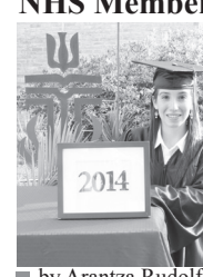
by Arantza Rudolfo