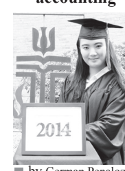
by German Penaloza