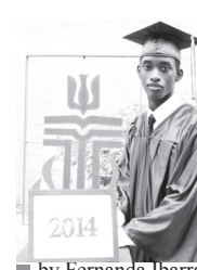
by Abiel Cardenas