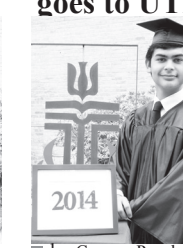
by German Penaloza