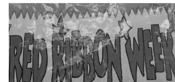
PAGE 7 Red Ribbon Week

NOVEMBER 5, 2008 • VOLUME 5 • ISSUE 3 • KINGSVILLE, TX 78363