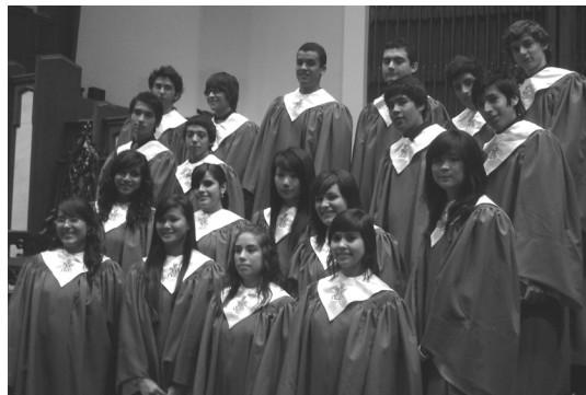
PAN AM'S MORRIS CHAPEL CHOIR PERFORMED AT FIRST PRESBYTERIAN CHURCH IN VICTORIA.