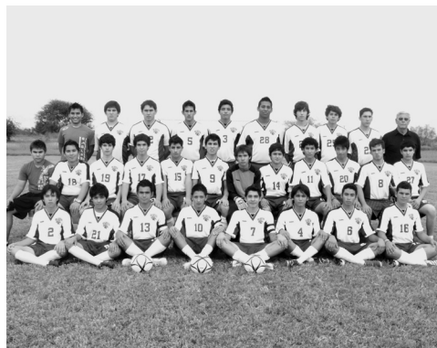
2008-2009 PAN AM EAGLES SOCCER TEAM

"I think we have improved our level and we have