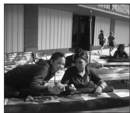
PAGE 8 Art Walk