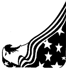
Harvest Park Patriots