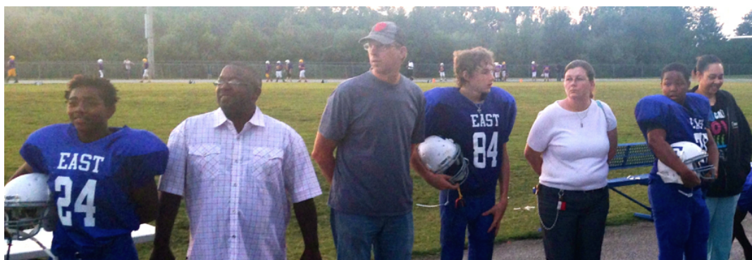
Pictured: Eighth Grade football players being honored with their parents