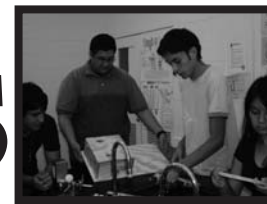
PAGE 5 ROBOTICS

NOVEMBER 25, 2009 • VOLUME 6 • ISSUE 5 • KINGSVILLE, TX 78363