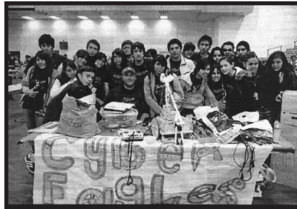
2009 CYBER EAGLES ROBOTICS TEAM COMPETED AT TAMUK ON OCTOBER 24 AGAINST AREA SCHOOLS.

"I joined the team because it was a new and interesting thing to do," she said. "The