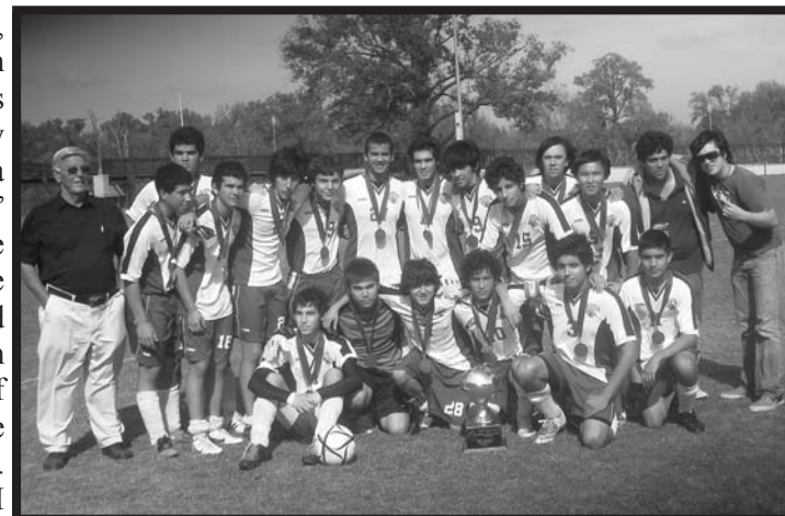
2009 Presbyterian Pan American School TAPPS state soccer champions.