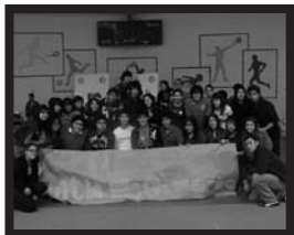
PAGE 2 RED RIBBON WEEK