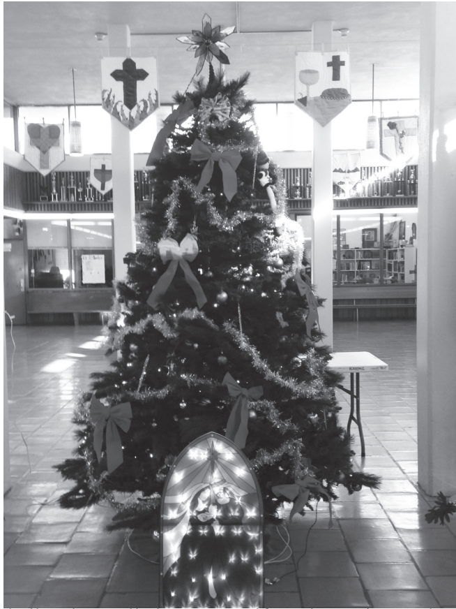
hall, where all the students ate and exchanged gifts. The entire student body participated in a

The program started in chapel with a celebration, including a performance by the praise band and students shared Bible verses. After chapel, students had a Christmas banquet in the dining