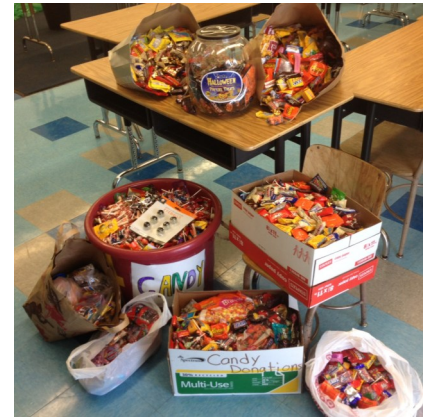
Loads of Halloween candy donated to haven Hills Shelter

Serrania PTA is partnering with the Serrania Charter for Enriched Studies Community Committee for a Holiday Toy Drive (December 3-7) benefiting Haven Hills and Penny Lane Centers. A list of preferred items will go home in next week's Tuesday packet, and the Toy Drive Collection area will be located in the school auditorium. Let's work together to make this a holiday to remember for kids who really deserve it!