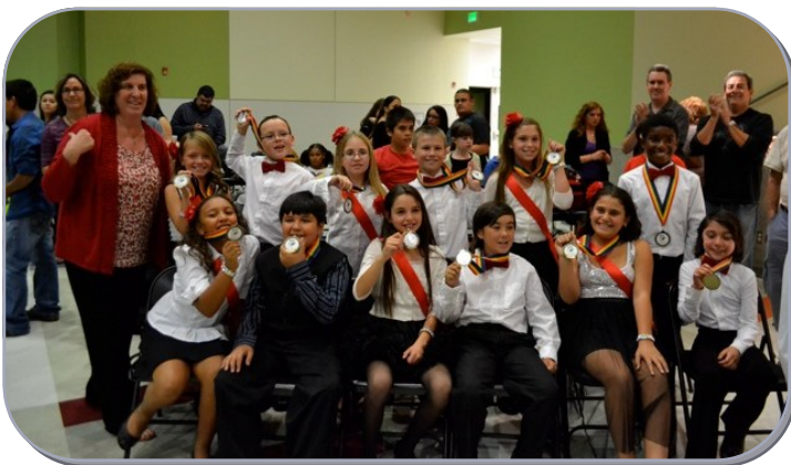
Serrania's 5th Grade Ballroom Dance Team Wins Gold!

You may next see their fabulous dancing skills at the Winter Program on December 10, 11, and 12. Or come root them on May 29 at the Color of the Rainbow Finals located at Grand Park in Los Angeles. More details forthcoming.