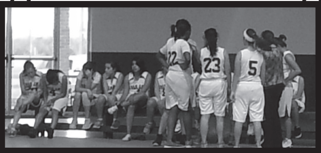
Lady Eagles girls basketball against Orange Grove

They worked hard and finally, they won against Orange Grove Freshmen. The Lady Eagles scored 38, and their opponent scored 18. It was a big win with